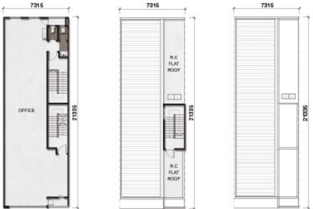
SECOND FLOOR LOWER ROOF ROOF